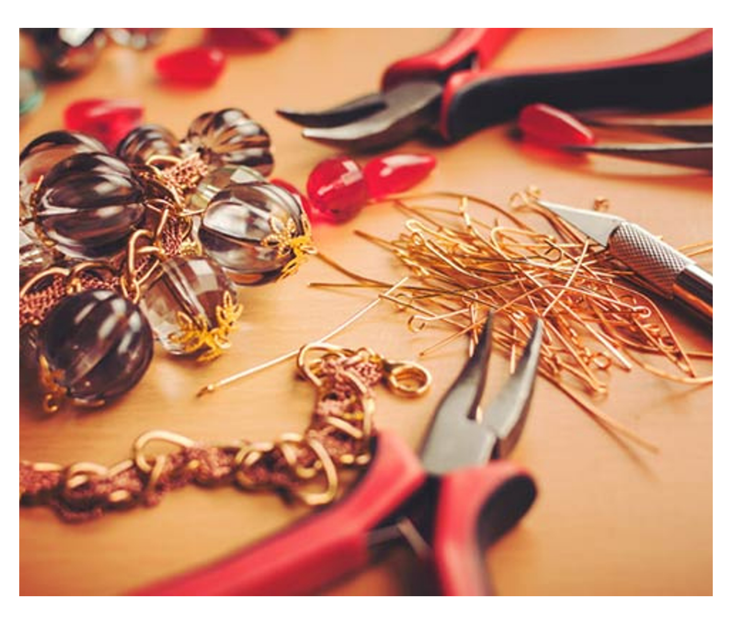
Overnight: Coffee Bungalow

Today you will wake up to learning the art of designing your own masterpiece. Take a tour through a gem store and meet with one of the Signature personalities of ArTravele who will guide you through designing your own piece of jewelry. As a designer you will be inspired by the latest methods of designing coupled with the knowledge you have gained of the varying methods of excavating, cutting, polishing and designing used throughout the generations of the industry. Afterwards you have the option to go through many different varieties of stones available in Sri Lanka and the varying stories which speaks of its properties.