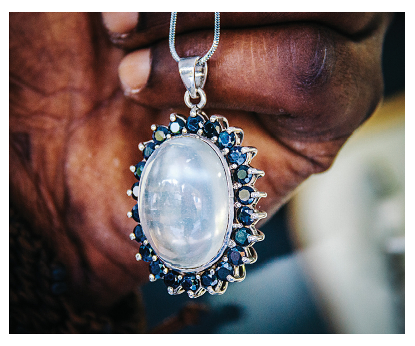
Overnight: Taru Villas, Rampart Street

Afterwards you will have the rest of the day to relax at your hideaway at your own pace.